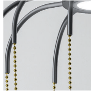
anthracite grey wrinkled / chains: natural brass