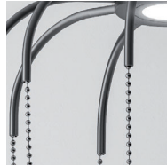
anthracite grey wrinkled / chains: black polished nickel