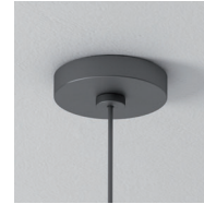
anthracite grey canopy